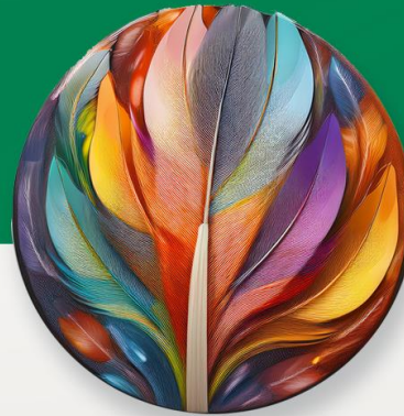
The Barbs that Lock Together Wisdom

Understanding: He that is slow to wrath is of great understanding: but he that is hasty of spirit exalteth folly. Pro 14:29