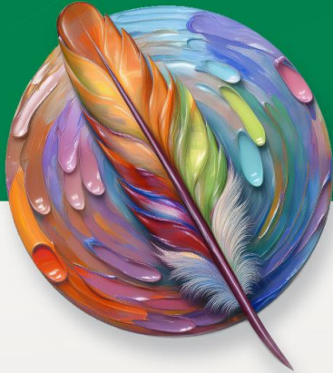
3 Feather Layers Instruction, Knowledge, Understanding

Charity, which is "Not Easily Provoked, is like Water Off a Duck's Back" can also be explained through the book of Proverbs.