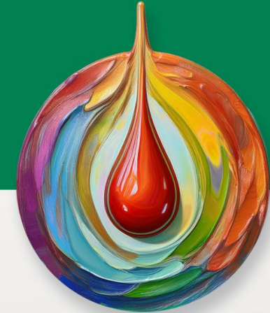
Oil Glands that Seal Fear of the Lord, No Sin - All Life

Trust in the LORD with all thine heart; and lean not unto thine own understanding. Pro 3:5